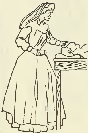
CIVIL WAR 1861-1865